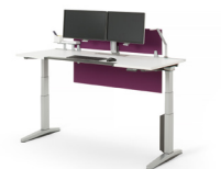
Privacy and modesty screens available to connect to the integrated rail.