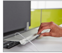
The integrated rail supports ergonomic tools such as lighting, monitor arms, screens and worktools.