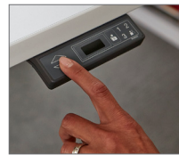
Programmable user interface