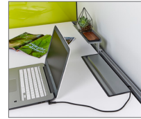
The power access door offers effortless access to three power outlets and two USB ports, providing two amps of power per port.