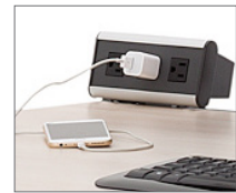
The power strip supports fixed and mobile technology while providing easy and visible access for users.