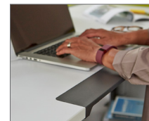
The soft edge embedded into the worksurface provides support for wrists and forearms to reduce stress on the neck and shoulders. Optional antimicrobial treatment