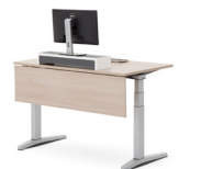
Modesty panels available in laminates and veneer in widths from 34" to 76" Widths are parametric to 1/16".