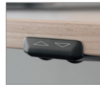
Intuitive user interface Optional antimicrobial treatment